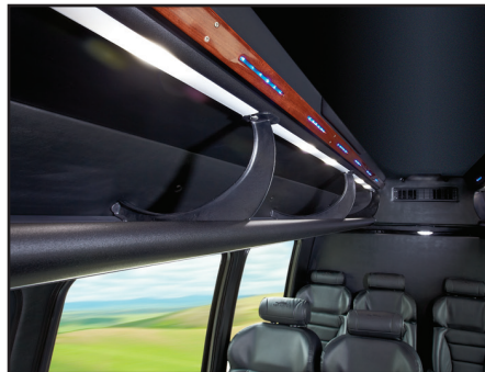
Unique 19.6" wide profile