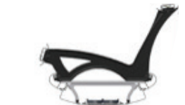
SWAN CONSTELLATION A/C