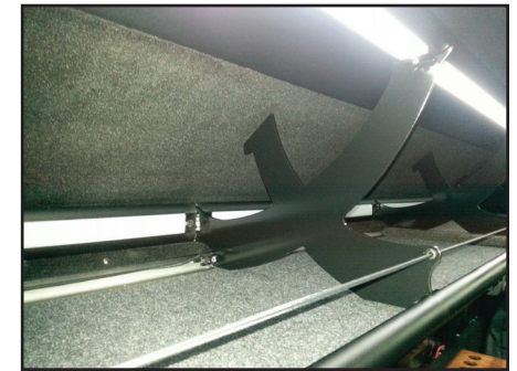
The largest loading floor space available