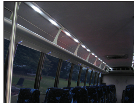
Our most popular and flexible model