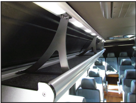
15" profile for narrow buses